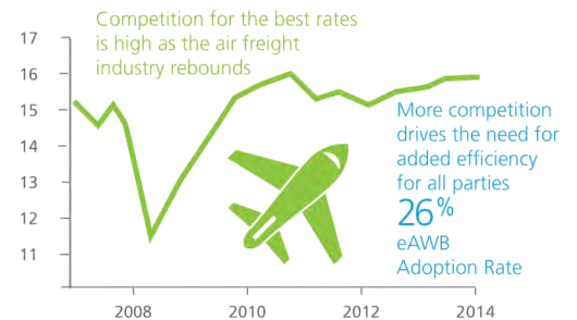
FREIGHT TON KILOMETERS/MONTH (USD, BILLIONS)