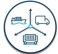
Ocean, Rail, and Truck